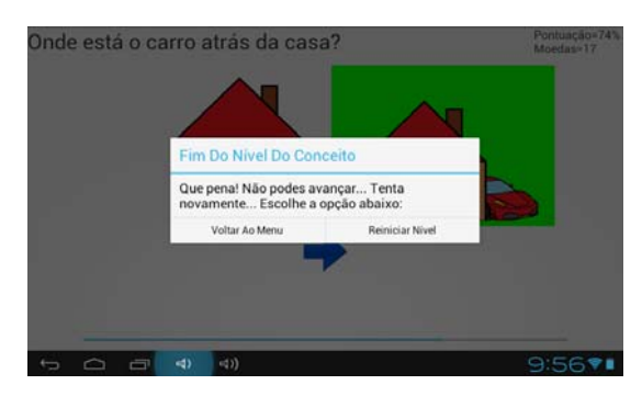
Figure 4. Message at the end of the concept level.