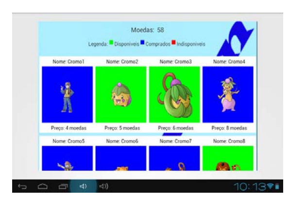
Figure 3. The stickers' booklet.

Fon's party. Stickers can be printed to be colored. Every time a sticker is bought it will fill a gap in the stickers' booklet (see Figure 3), which was designed to stimulate the user to play the game, wanting to hit as many activities as possible, even after concluding a level. This way, the user will be motivated to repeat a level until all its activities are responded correctly. The gameplay requires a certain percentage of correct answers in order to allow the user to pass to the next level. For instance, Figure 4 shows a message that appears after the execution of all the activities in the concept level. The user is not able to move forward to the next level since her performance is below 75%. This percentage can be adjusted by the therapist.