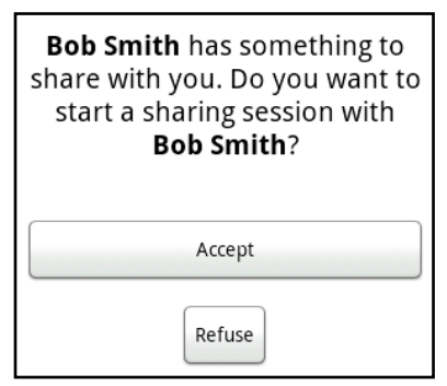
Figure 2. Request received by session receiver to start a sharing session.

status-quo co-located mobile search practices shows that mobile users often stumble upon interesting search results that they would like to share with their friends. At present, sharing is done by speaking aloud or showing the mobile device. Users rarely relinquish control of their handset to share such content due to various privacy concerns and issues related to control [3]. And while mobile Web content can be shared electronically, e.g. emailing, sharing via social networks, these mechanisms are seldom used due to their cumbersome nature [3]. All in all attempts to share Web content often lead to frustrations because mobile search engines are designed primarily for solitary use and provide limited support for sharing content with other people.