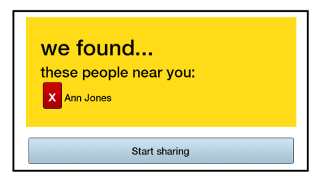
Figure 3. List of session members for review by session initiator.